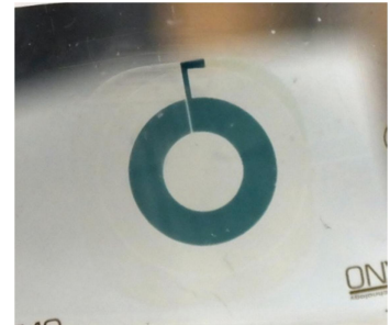
Abb. 1: EC Iris, with the inner ring switched on

For questions, comments or suggestions: cjoerg@physik.uni-kl.de